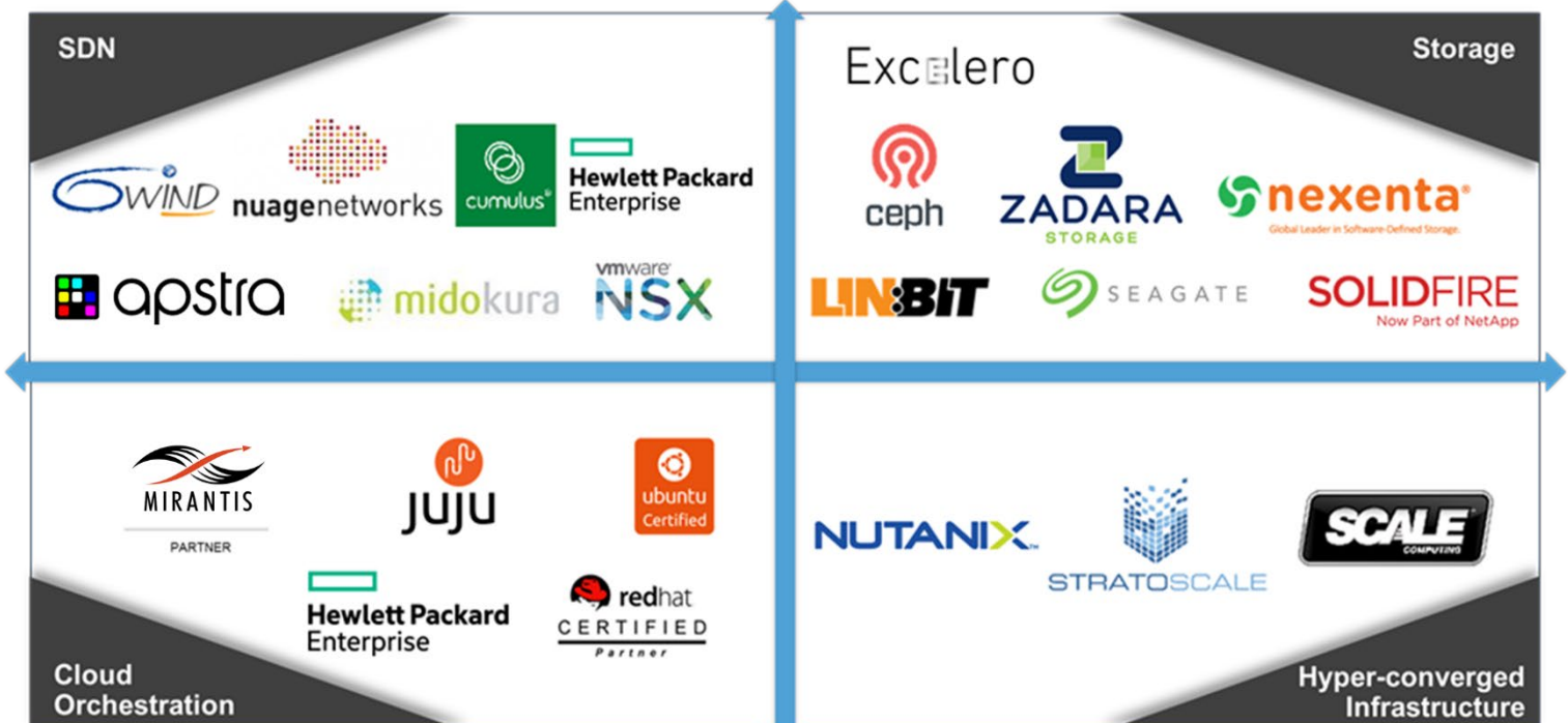
Figure 2. Mellanox’s Comprehensive Cloud Partner Ecosystem

From the ground up, starting at the switch silicon level, Spectrum is designed with a flexible processing capacity so that it can accommodate a programmable OpenFlow pipeline that enables packets to be sent to subsequent tables for further processing, and allows metadata to be communicated between OpenFlow tables. In addition, Spectrum is an OpenFlow-hybrid switch that supports both OpenFlow operation and normal Ethernet switching operation simultaneously. Users can configure OpenFlow at port level, assigning some Spectrum ports to perform OpenFlow based packet processing operations and others to perform normal Ethernet switching operations. Spectrum can even mix and match algorithms on the same switch port by using a classification mechanism to direct traffic to either the OpenFlow pipeline or traditional Ethernet processing.