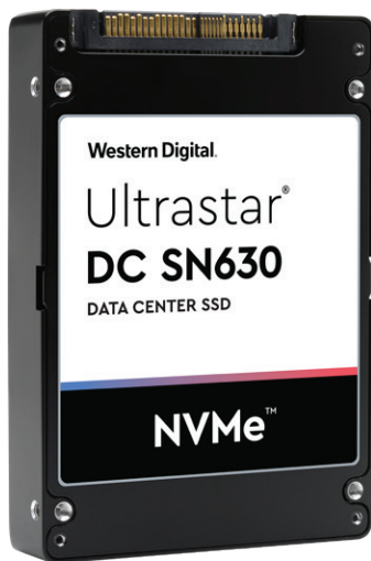
Ultrastar DC SN630 NVMe SSD

The Ultrastar DC SN630 is an enterprise class NVMe SSD optimized for balanced price and performance cloud storage. NVMe was developed to connect high performance flash memory to compute resources over native PCIe links. It eliminates the legacy SCSI command stack and direct-attached storage (DAS) bottlenecks associated with traditional SATA and SAS. The Ultrastar DC SN630 is available in capacities from